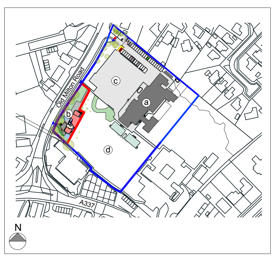
Site Location Plan-Scale 1:2500